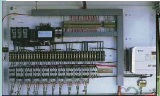
Equipped with many standard features to maximize productivity and ensure safety.